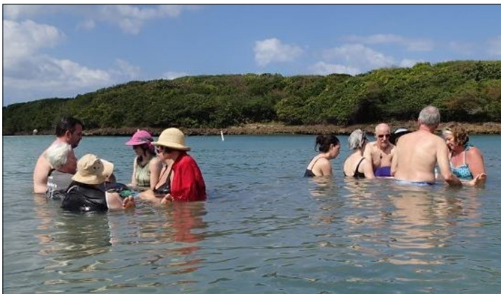
Team Healings in Puerto Rico waters!

Visit www.wayshowerscollege.com for the full descriptions & pricing of each Part of the Regrouping!